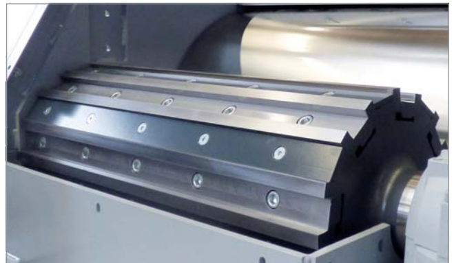
Impact roller with impact bars and heavy-duty wear plates